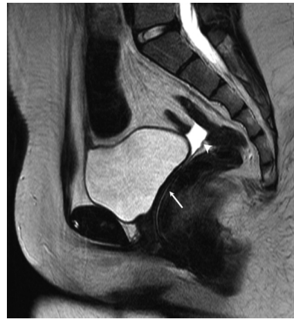
Fig. 2. Sagittal T2 TSE shows a blind-ended vagina (white arrow) between the bladder and the rectum posteriorly and the absence of Müllerian structures, such as the uterus; a fluid collection fills the Douglas pouch (white arrowhead).

Commonly included in the differential diagnosis are other causes of primary amenorrhea, in particular the Mayer-Rokitansky-Kuster-Hauser (MRKH) syndrome, characterized by Müllerian duct anomalies (congenital absence of the upper part of the vagina, uterine agenesis, or