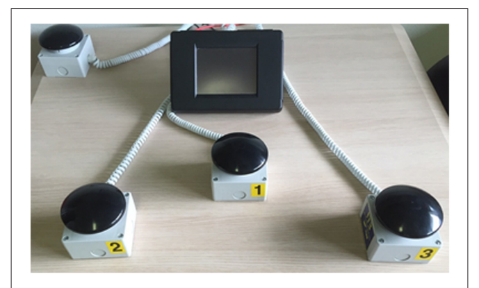
FIGURE 1 | Device used to assess attention. System used to assess attention by the evaluation of the performance in a computer-controlled reaction times (RTs) paradigm (ITB Sport Reflection, F.M. Automazione S.r.I., Brescia, Italia).

Patients underwent attentive tasks at 9 AM, during the medication "on" state, at the enrollment and at the end of MIRT. Healthy controls were evaluated at the same time of the day. All subjects were tested in a laboratory setting, with constant lighting condition (artificial light) and without auditory interferences.