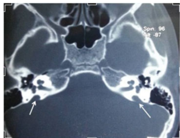
Fig. 3 Computed tomography scan of case 3 showing bilateral large vestibular aqueduct.

A girl 4 years and 8 months old was referred from Deaf Screening camp organized in a remote area of Tamil Nadu, India. According to her parents, she did not respond to sound since early childhood and not developed speech and language even after use of hearing aids. She was admitted to a deaf school in the village. She had an uneventful pre- and postnatal period and a birth weight of 3.5 kg. The parents had a history of consanguineous marriage. She was also assessed preoperatively, as in case 1, and the reports were similar, confirming cochlear hearing loss. Temporal bone CT scan evidenced LVA (1.9 mm) on both sides (►Fig. 3). She also received her implant in the right ear. In this case also a pulsatile RW could clearly be noticed after exposing the RW via standard transmastoid facial recess approach, but the pulsatile stapes sign was not obvious even after dislocating the I-S joint. An incision was made on the RW membrane. Immediately after the puncture, CSF started leaking in a pulsatile manner. After elevating the head end of the operating table, the gusher decreased significantly. Within a few minutes, the CSF gusher was well controlled without a mannitol drip. Then electrode array was inserted via the RM. The last two pairs of electrodes could not be inserted as a resistance could be felt at the end. Temporalis muscle fascia was used to seal the fenestrum