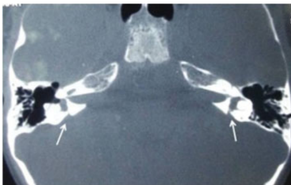
Fig. 2 Computed tomography scan of case 2 showing large vestibular aqueduct.

A boy 5 years and 9 months old born from consanguineous parents presented to our Implant Outpatient Department with a history of hearing problems noticed by the parents at the age of around 12 months, when the child had not developed speech and language. Antenatal, natal, and post-natal history was normal, as well as family history. His other developmental milestones were within normal limits. He was also assessed by the ENT consultant, audiologist, psychologist, and speech therapist. The entire audiological package