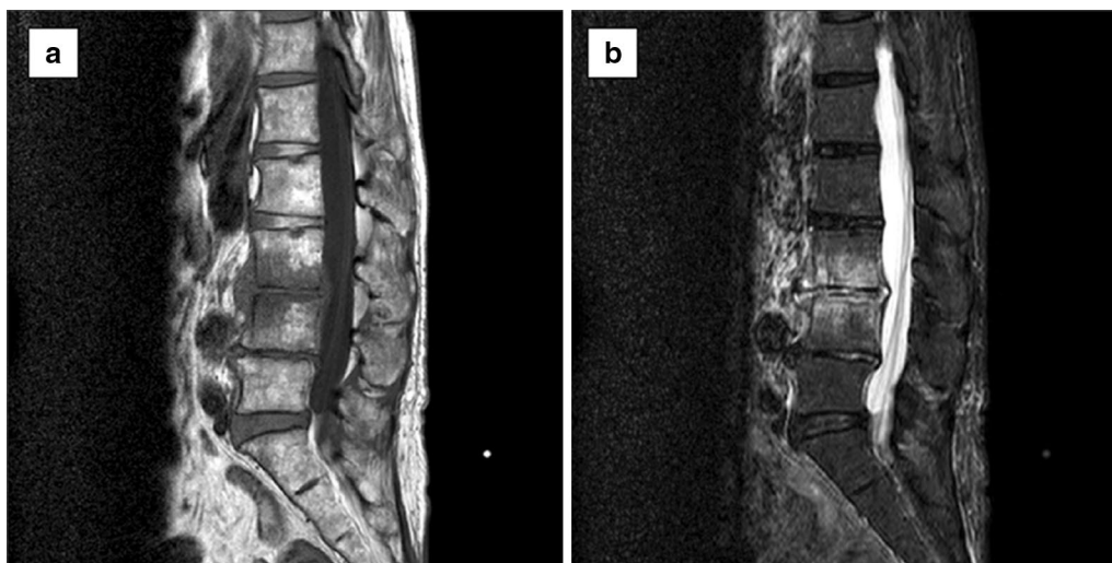
Fig. 2 Magnetic resonance image of lumbar vertebrae obtained on the 10th hospital day. T1-weighted image (T1WI) and short T1 inversion recovery (STIR) T2 image (a, b), respectively. The lumbar sequence is linearized and the findings do not suggest a compression fracture, i.e. there is no dip-related transformation of the vertebral body. Vertebral bodies L3 and L4 have a low signal on T1WI and a high signal on STIR. The intervertebral disk is low and has a linear T2 high signal. We thus suspected this lesion to represent inflammation and/or degeneration

Streptobacillus moniliformis , present in some rodent intraoral resident floras, is an aerobic or facultative anaerobic gram-negative, highly pleomorphic, filamentous, nonmotile, and non-acid-fast rod [2]. S. moniliformis , as well as Spirillum minus , transmitted by bite wounds and scratches from rodents such as mice, can cause systemic rat bite fever. This condition is due to infection by S. moniliformis or, less commonly, by S. minus . Disease caused by S. minus is generally known as Sodoku and occurs primarily in Asia [2]. After the incubation period of 2–10 days, symptoms progress to high fever, arthralgia of multiple joints, muscle ache, and whole body rash [1, 13–16]. In previous reports, arthritis occurred mainly in large joints including the elbows, knees and mid-back, while rashes of the palms or soles and were erythematous [3, 13, 14, 16–19]. Such skin lesions were occasionally accompanied by abscess formation [2]. On the other hand, S. moniliformis was reported to be a causative pathogen of infectious endocarditis [1, 20–24] or to be associated with immunocompromised status including human immunodeficiency virus (HIV) infection and hematological malignancies [24–26]. Furthermore, there