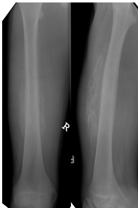
Figure 2 Heterotopic ossification remote to the fracture site at the contralateral femur.

[23]. Unfortunately, a general and comparable classification system of all joints to date does not exist. We therefore adapted and modified Brooker's classification in a similar way to the other joints and defined the extent of the heterotopic ossification accordingly (grade 1-grade 4, in the following "radiologic ossification class"). Additionally, the maximum expansion on both films was measured in mm. Furthermore, the location at the fracture site (fractured long bone between the adjacent joints) or at a site remote to the fracture site (any non-adjacent part of an extremity) was noted. All the x-rays were analysed and classified by two independent trauma surgeons (J. S. and C. P.).