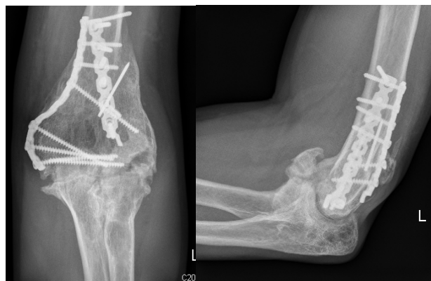
Figure 1 Heterotopic ossification following plate osteosynthesis of a distal humerus fracture.

Today, Brooker's classification is widely accepted for classification of the HO around the hip joints, classifying HO into 4 grades ranging from just visible (grade 1) to total ankylosis (grade 4) in standardized x-rays in two planes