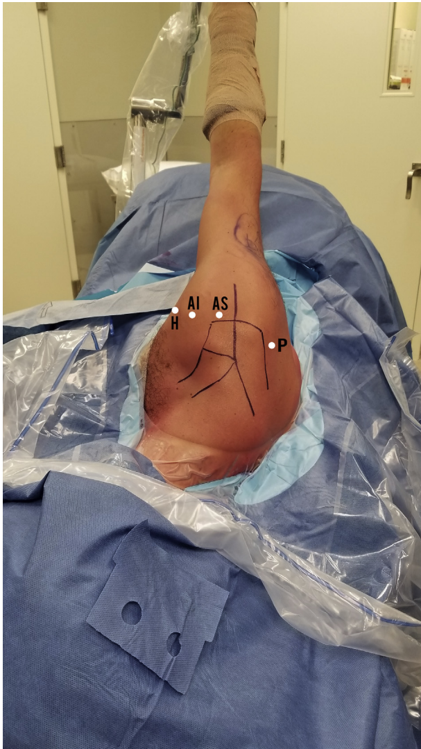
Fig 2. Patient positioning in lateral decubitus with arm positioning in SPIDER2 limb positioner and marking of surgical landmarks and arthroscopic portals. AI, anteroinferior portal; AS, anterosuperior portal; H, head of humerus; P, posterior portal.

tension on the conjoined tendon. Traction is released from the shoulder, allowing the head of the humerus to be reduced into the glenoid under direct vision. The far medial portal or Halifax portal is now created using the inside-out technique previously published by our team. 8,17,18