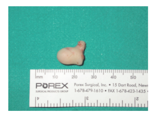
FIGURE 2: The excised mass; histological exam was consistent with a clear cell renal cell carcinoma.

with partial erosion of the crista galli. MRI confirmed the evidence found at computed tomography (Figure 1). Fine needle aspiration showed typical epithelial tissue and clear-cytoplasm cells interpreted as pericytes. Preoperative local biopsy was not performed due to the history of severe epistaxis and the high risk of massive bleeding during the procedure.