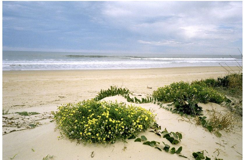
FIGURE 1 Dune Ecotype of Senecio lautus at Boambee beach, Coffs Harbour