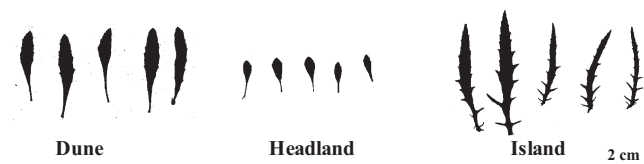
FIGURE 2 Leaf trait differences between populations of Senecio lautus grown in common garden experimental conditions. Archetypes of leaf shape from three ecotypes of S. lautus . Mean and standard deviation of leaf shape traits from the 28 Dune (D), 37 Headland (H), and 22 Island (I) plants grown in common garden from field-collected seeds. Traits are defined as follows: area (mm 2 ), circularity (% overlap with circle of equal area), compactness (perimeter: area), dissection (perimeter 2 /length), indent density ( n indents/perimeter), length (mm), number indents ( n ), perimeter (mm), width (mm)

and the highest pH. Headland soils were slightly alkaline and intermediate in all measures except aluminum, which was the highest across the three environments.