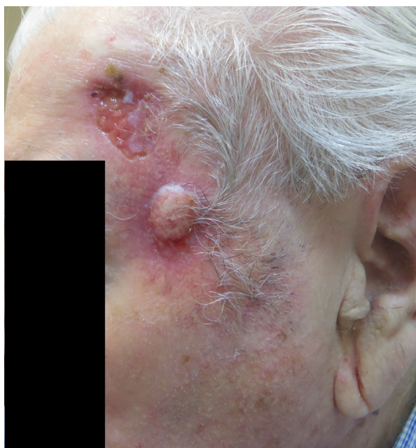
Fig. 1. 88-year-old man with a recurrent dermal-based squamous cell carcinoma following recent excision of a left temple squamous cell carcinoma (superior wound) with a positive deep margin. He was recommended a hypofractionated course of radiotherapy treating the post-op site and the recurrent lesion utilising orthovoltage energy photons to a dose of 28 Gy in 4 fractions delivered twice per week.