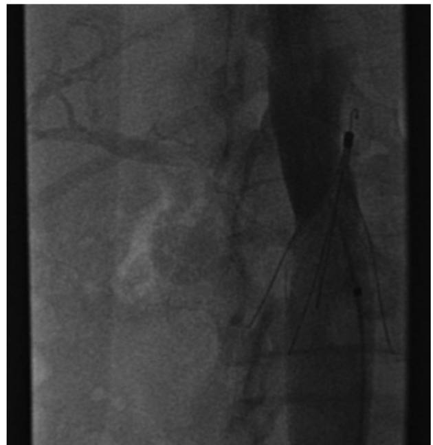
Figure 3: Excessive tilting of the IVC filter causes the hook of the filter to appear outside of the lumen of the IVC.

Duodenal intramural haematoma can occur secondary to blunt abdominal trauma and this is the most common cause particularly in the paediatric population. Other causes include coagulopathy (inherited and acquired), haematological malignancies, mesenteric venous obstruction, endoscopic procedures, percutaneous drainage procedures, pancreatic pathology, peptic ulcer disease and aortoenteric fistula [1-3]. Bleeding is thought to occur in the submucosal layer [3]. There have been no reports in