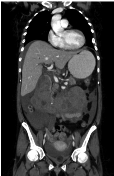
Figure 2: A coronal section of a venous phase abdominal CT demonstrating the end of the IVC filter strut penetrating the wall of the third part of the duodenum.

third parts, obstructing the duodenal lumen. There was pneumatosis of the duodenal wall, haemoperitoneum and free blood.