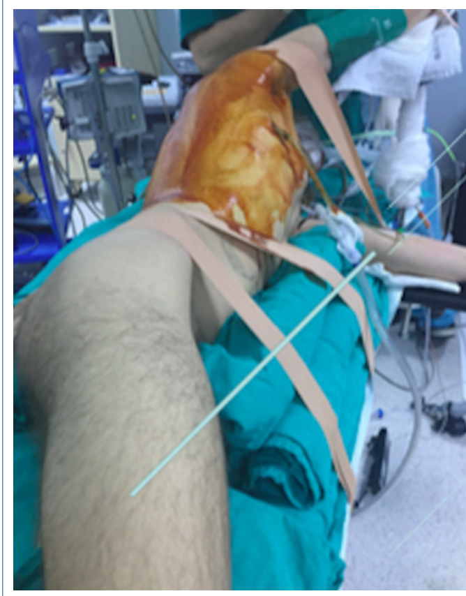
Figure 1. The patient's position.