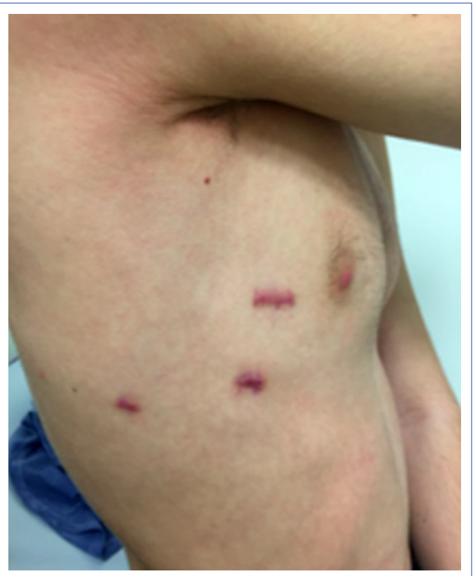
Figure 3. Postoperative appearance.