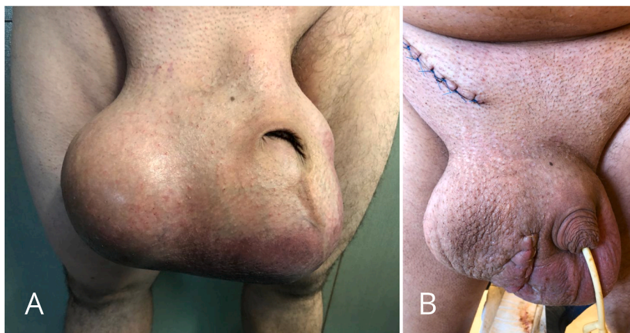
Fig. 2. Huge enlargement of the scrotum (A). Appearance of the scrotum after right-sided orchietomy performed with separate inguinal and scrotal incisions (B).

bilaterally ligated. As it was not possible to remove the enlarged testis through the inguinal canal, the separate scrotal approach was carried out. The testis was mobilized and removed via the scrotal incision. Histopathology revealed a malignant mixed germ cell tumor consisting of embryonal carcinoma and teratoma, of 14 × 13 × 12cm in size (Fig. 3A, B, 3C, 3D). The postoperative course was uneventful. The patient was discharged and referred to an oncology outpatient clinic for further treatment.