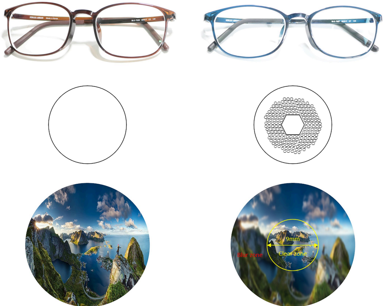
Fig 1. Single vision (SV) lenses on the left and defocus incorporated multiple segments (DIMS) on the right. The visual effect of the DIMS design is shown as well for an example picture.

https://doi.org/10.1371/journal.pone.0258441.g001