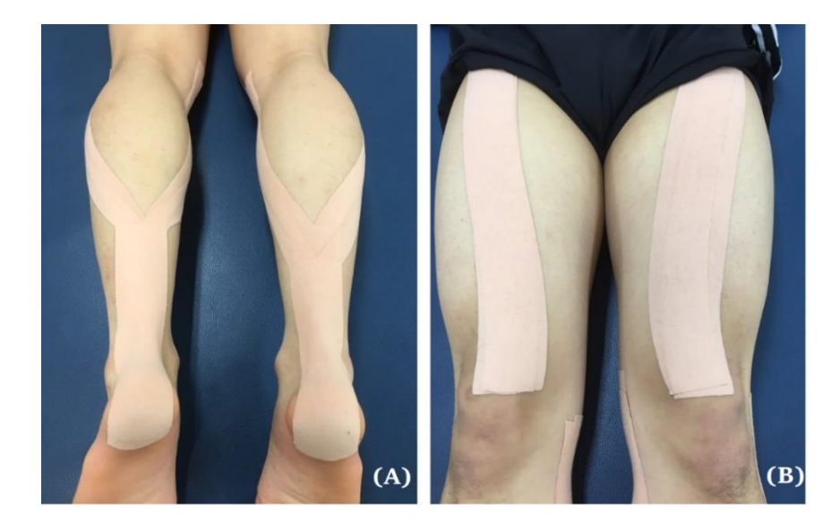
Figure 2. ( A ) Kinesio taping with double-taped application to the calf muscle; ( B ) Kinesio taping with double-taped application to the rectus femoris.