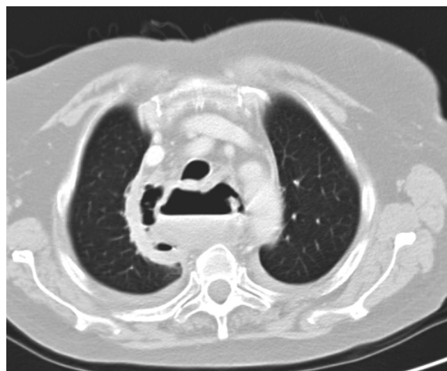
Fig. 2. Mediastinal leakage from oesophageal rupture.

Early diagnosis and management of oesophageal perforation is difficult but imperial in reducing morbidity and mortality. 5,6 Whether surgical or conservative treatment is indicated depends mainly on the general health of the patient, time elapsed and the size of the perforation. Thoracic oesophageal perforations are usually differentiated in those contained within the mediastinum and those noncontained that drain into the pleural space as with our