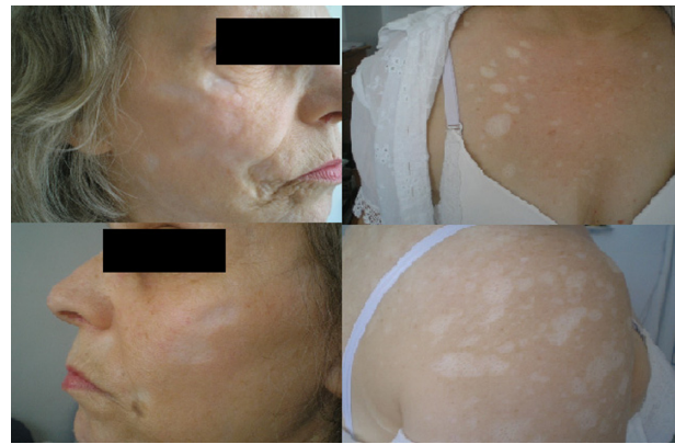
Figure 3 Atrophic scars on the face, trunk, and shoulders.

documents were filled with hospitalizations, investigations, and therapies for the last 2 years, varying from chronic eczema, anetoderma, morphea, prurigo, discoid lupus erythematosus, mycosis fungoides, and others not remembered by the patient. The patient was in good medical condition, with no comorbidities, treatments, or complaints. Clinical examination did not reveal anything worthy.