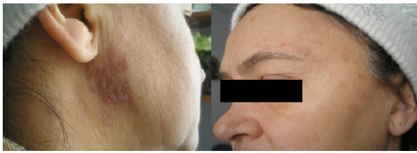
Figure 1 Scars with irregular borders, slight erythema, hyperpigmented postinflammatory scars on the pre-auricular area on the face.

She was referred to the hospital under suspicion of discoid lupus; a punch biopsy was taken from the preauricular area. The histopathological report excluded lupus and concluded orthokeratosis, spongiosis, and sparse lymphocytic perivascular infiltrate in the dermis (Figure 2).