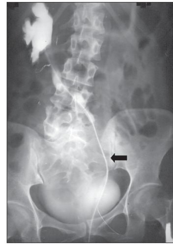
Figure 2: Arrow showing catheter in the ureter

We hypothesize that due to the obstructing low transverse