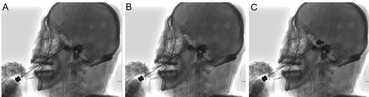
Figure 3 Intraoperative lateral X-ray fluoroscopy of the same patient (A-C): (A) completion of trajectory A; the puncture needle tip reached the inner opening of the foramen ovale; (B) completion of trajectory B; the balloon catheter was placed to a predetermined depth, at this time the tip of the balloon catheter located at the target of trajectory B; (C) The injection of contrast agent (iohexol) filled the balloon to create a typical "pear-shape".

catheter passed the first scale line, there was generally a sense of breakthrough. The needle was inserted according to the length of trajectory B to the predetermined depth. The tip of the balloon catheter was located at the target point of trajectory B. The position of the balloon was then reconfirmed under lateral X-ray fluoroscopy, and 0.3 mL of contrast agent (iohexol) was injected for exploratory filling; the bottom of balloon is strengthened to a volume of 0.5–0.8 mL. The balloon was "pear" shaped. (Figure 3) Individualized balloon inflation compression time ranged from 120–480 seconds, with longer time for recurrent cases. (Table 2) After compression was completed, the contrast agent was withdrawn, the balloon catheter and the puncture needle cannula were completely withdrawn, the puncture point was compressed for ten minutes, and the surgery was finally completed.