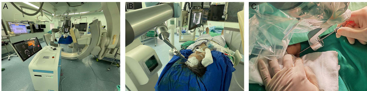
Figure 2 Operation process (A-C): (A) shows the layout of the operating room; the robot workstation is located at the patient's head; (B) the patient's head was fixed with a shaping pillow and scalp markers were attached to the forehead of the patient for registration and to improve postoperative comfort; (C) Complete foramen ovale puncture guided by the robotic arm adapter.