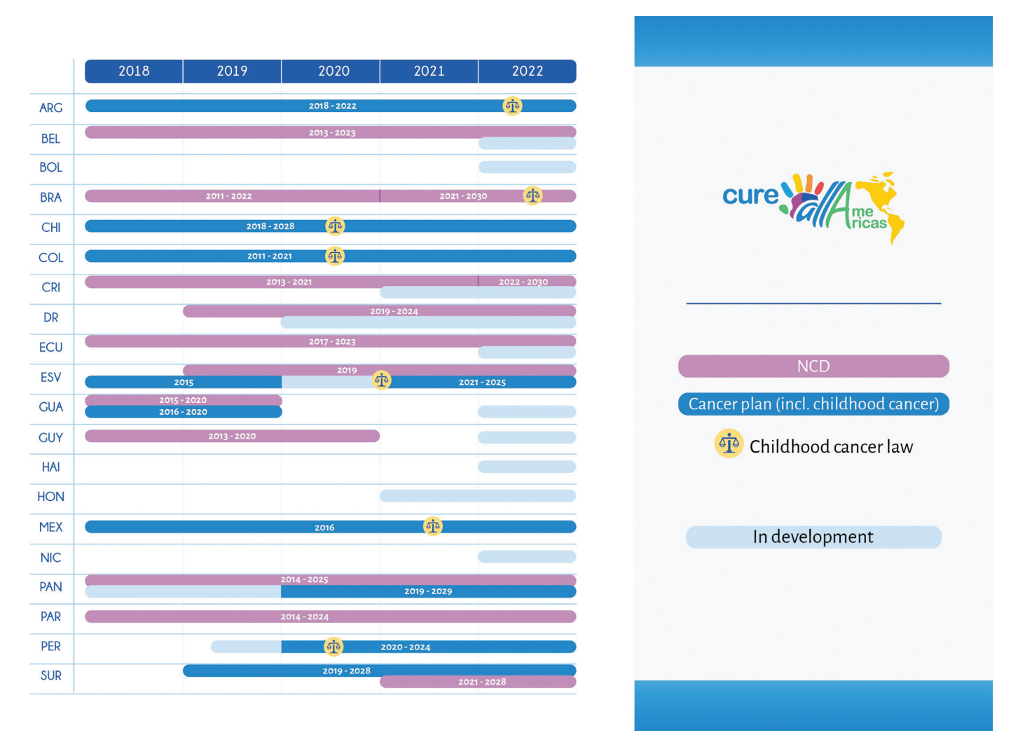
FIGURE 2: Regional Global Initiative for Childhood Cancer Working Group for Latin America and the Caribbean – national childhood cancer plan stage

Step 2: Where do we want to be? Time to establish the plan's objectives. Following the WHO Collaborative Centre