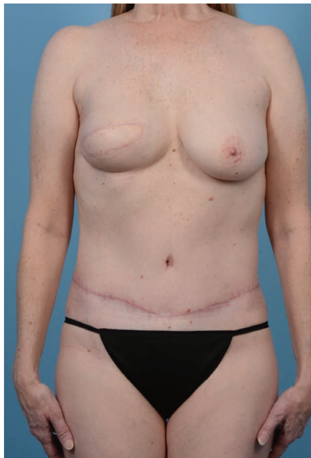
Fig. 2. Postoperative result at 2 months follow-up.

From the *Division of Plastic Surgery, Department of Surgery, Memorial Sloan Kettering Cancer Center, New York, N.Y.; †Division of Plastic Surgery, Department of Surgery, Icahn School of Medicine at Mount Sinai, New York, N.Y.; and ‡Ochsner Medical Center, New Orleans, La.