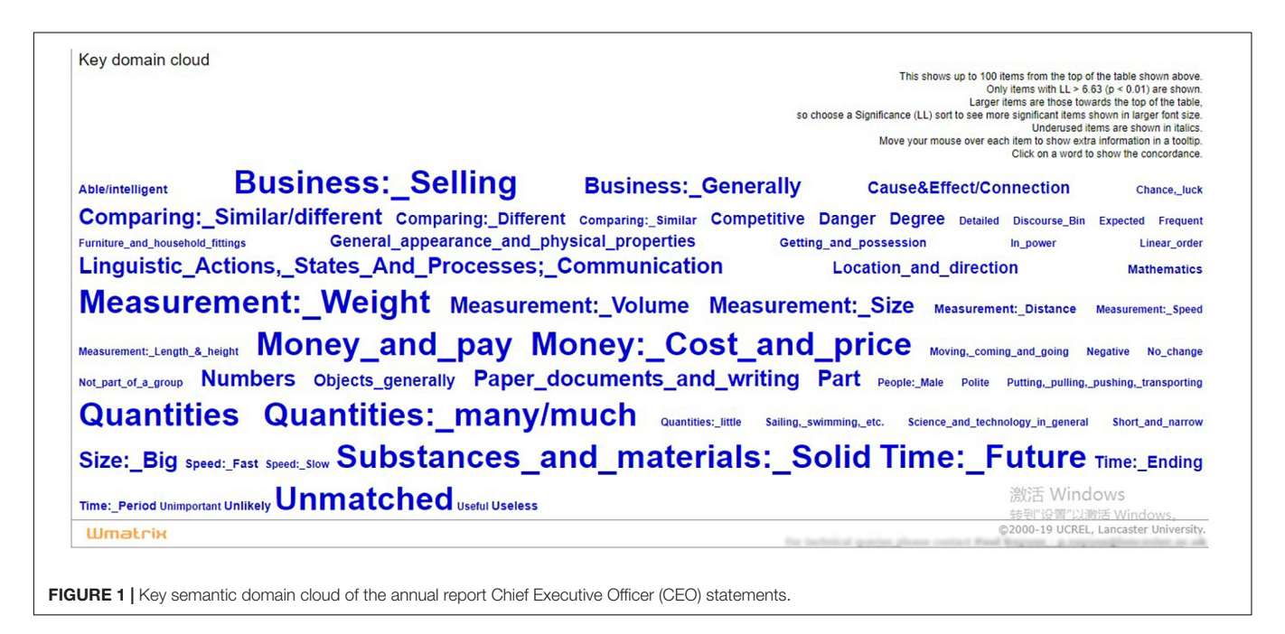
Figure 1 shows the key semantic domain cloud of the CEO statements in annual reports. Following Rayson (2008) who listed