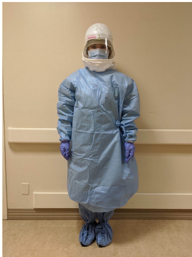
Figure 2 Healthcare worker demonstrating PPE attire under the surgical gown. PPE, personal protective equipment.