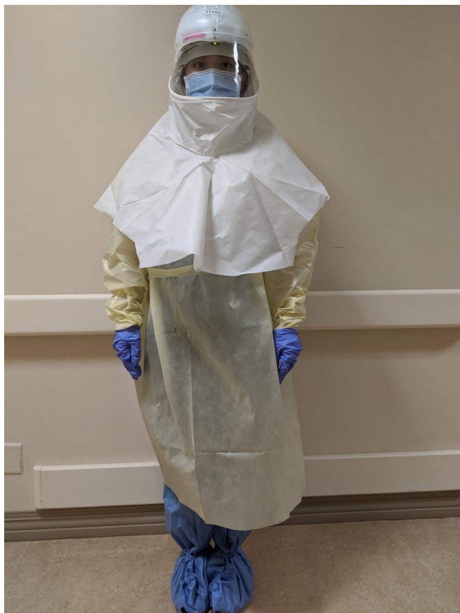
Figure 1 Healthcare worker's outermost PPE: PAPR with neck and shoulder cover, surgical gown and knee-high booties. PPE, personal protective equipment.