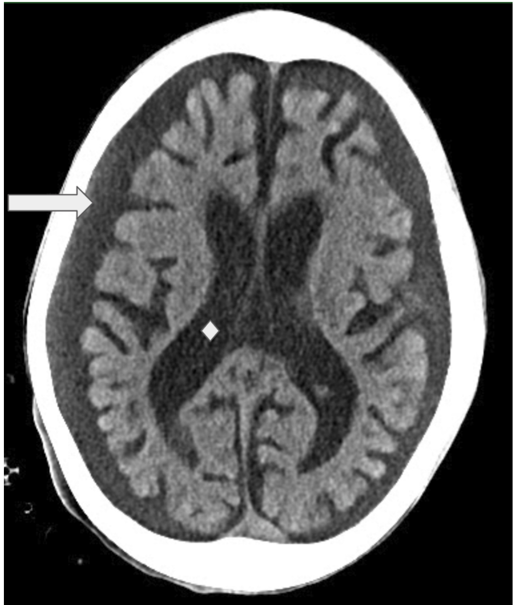
FIGURE 1: Head CT of the patient

Non-contrast CT of the brain demonstrates global parenchymal volume loss as evidenced by prominent cerebrospinal fluid spaces (arrow), prominent sulcation and ex-vacuo dilatation of the lateral ventricles (diamond)