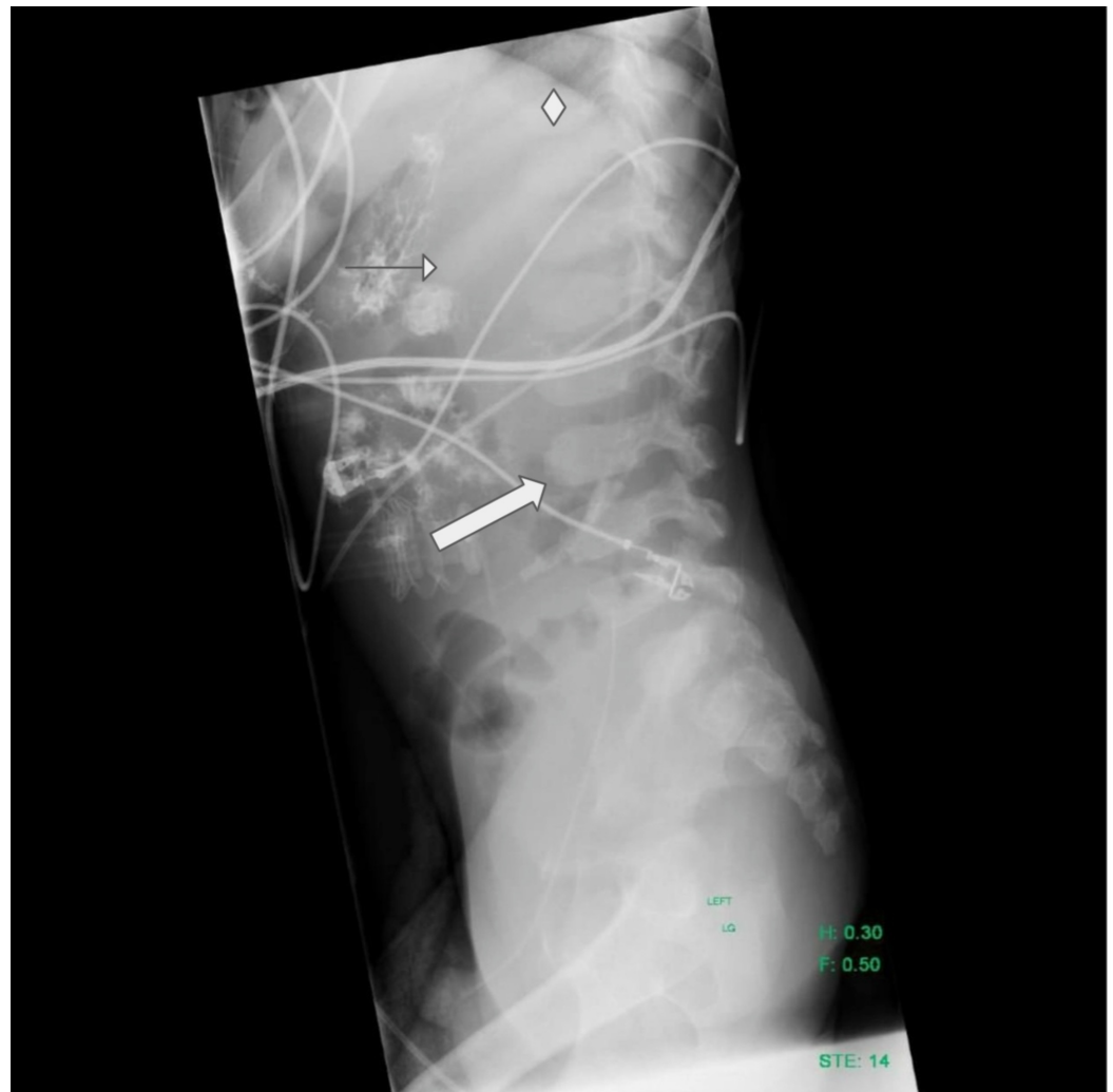
FIGURE 4: Lateral chest/abdomen radiograph

The image shows beaking of the anterior aspect of the lower thoracic and lumbar vertebral bodies (large arrow) and broadening of ribs (diamond), sparing posteromedial segments (small arrow). There is intraluminal bowel opacity due to sodium polystyrene sulfonate administration