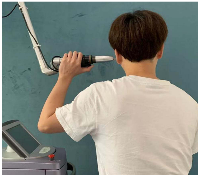
Figure 1 Treatment of patients with ultrasound from an ultrasonic therapy instrument.

possible without causing pain. At that limit, the distance between the upper and lower central incisors was measured. Other temporomandibular functions were assessed as described previously, 25,26 including mandibular movement (MM), jaw noise (JN), and disability index (DI). The craniomandibular index (CMI) was calculated based on relevant examinations. 26 The assessments were performed by physicians from a separate team who were blinded to patient's assignment and treatment.