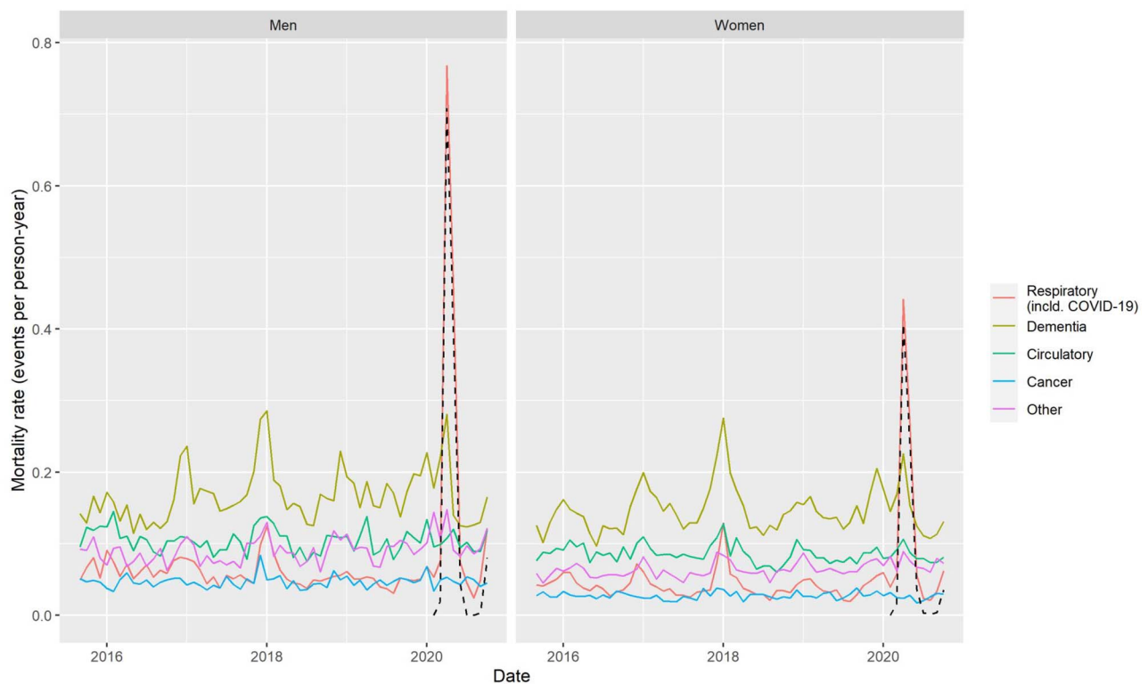
Figure 2. Sex-specific mortality by cause in care-home residents, October 2015 to November 2020. Dotted line indicates deaths with COVID-19 as the underlying cause that are a subset of respiratory deaths. All other causes are mutually exclusive.

for frailty [23]. When we expressed the mortality impact in terms of life expectancy, the impact of the pandemic on mortality from December 2019 to November 2020 was more than 2-fold larger than that seen during 2017/18, which included a severe influenza season. However, this observation needs to be seen in the context of the considerable efforts to prevent entry of SARS-CoV2 to care homes, and the fact that only 32% of care homes had any cases of COVID-19 [26].