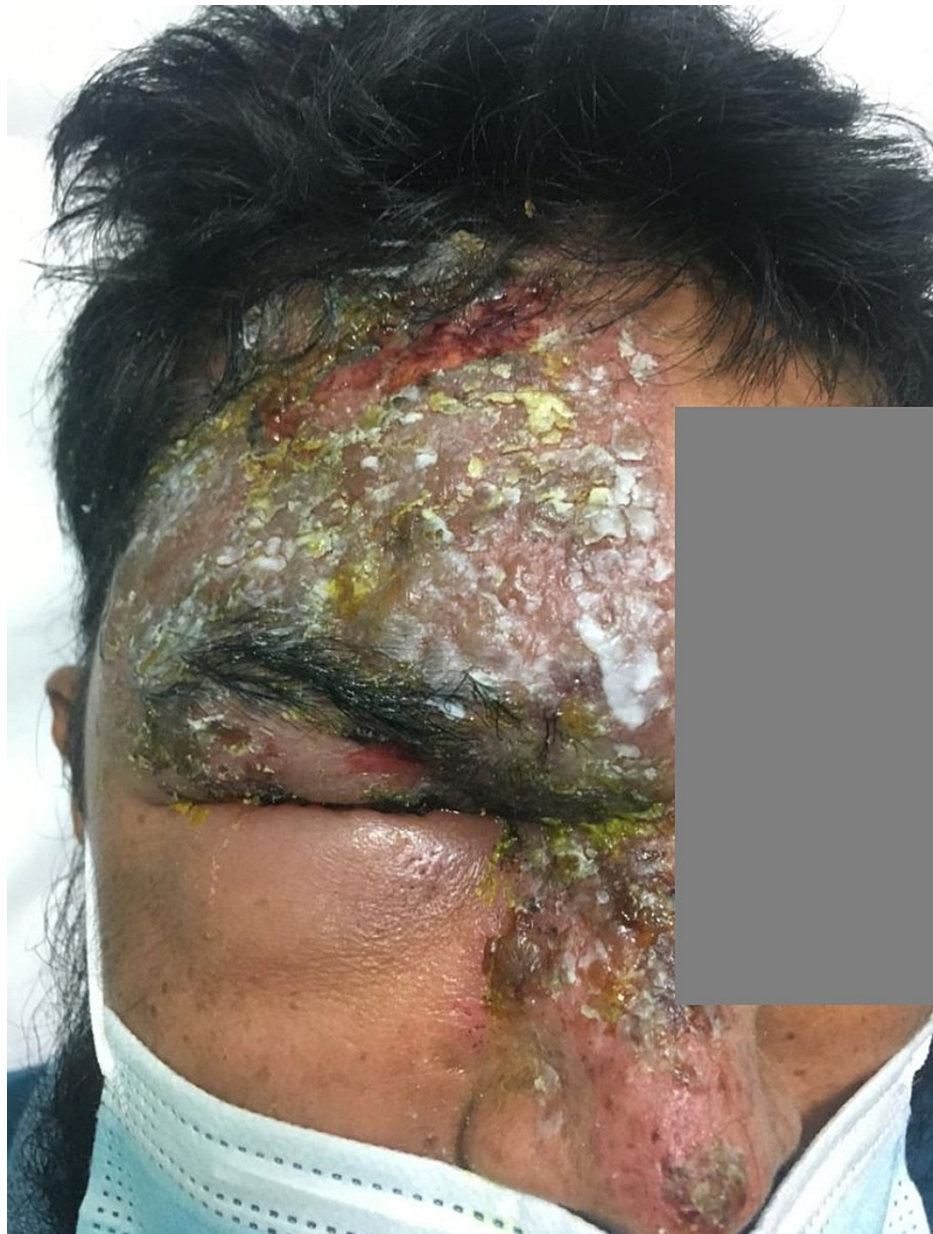
FIGURE 1: Extensive vesicular skin rash over the right V1 distribution with eyelid edema and positive Hutchinson's sign.

However, his condition did not improve, and his eyelid edema deteriorated to the point that he could not open his right eye even with help, so he was admitted to the hospital two days later. At this point, ophthalmologic testing was limited due to considerable eyelid edema.