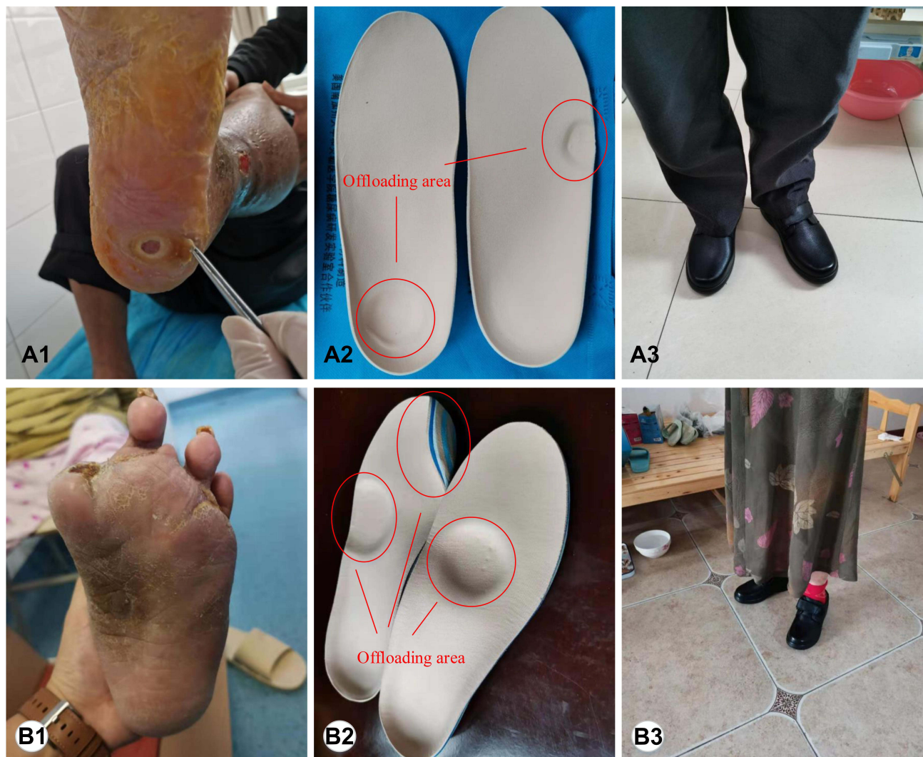
Figure 2 Profiles of patients' foot conditions and offloading therapy. Patient A: Recurrent neuropathic plantar foot ulcer on the left heel and the fifth right plantar metatarsophalangeal joint (A1). Personalized offloading insoles (A2). Wearing of the offloading footwear (A3). Patient B: Recurrent neuropathic plantar foot ulcer on the right foot and amputation of the first and third toes of the left foot (B1). Personalized offloading and orthopedic insoles (B2). Wearing of the offloading footwear (B3).

providing patients with more color choices, as well as styles and materials. Health facilities and clinicians should also increase awareness of different approaches for treatment