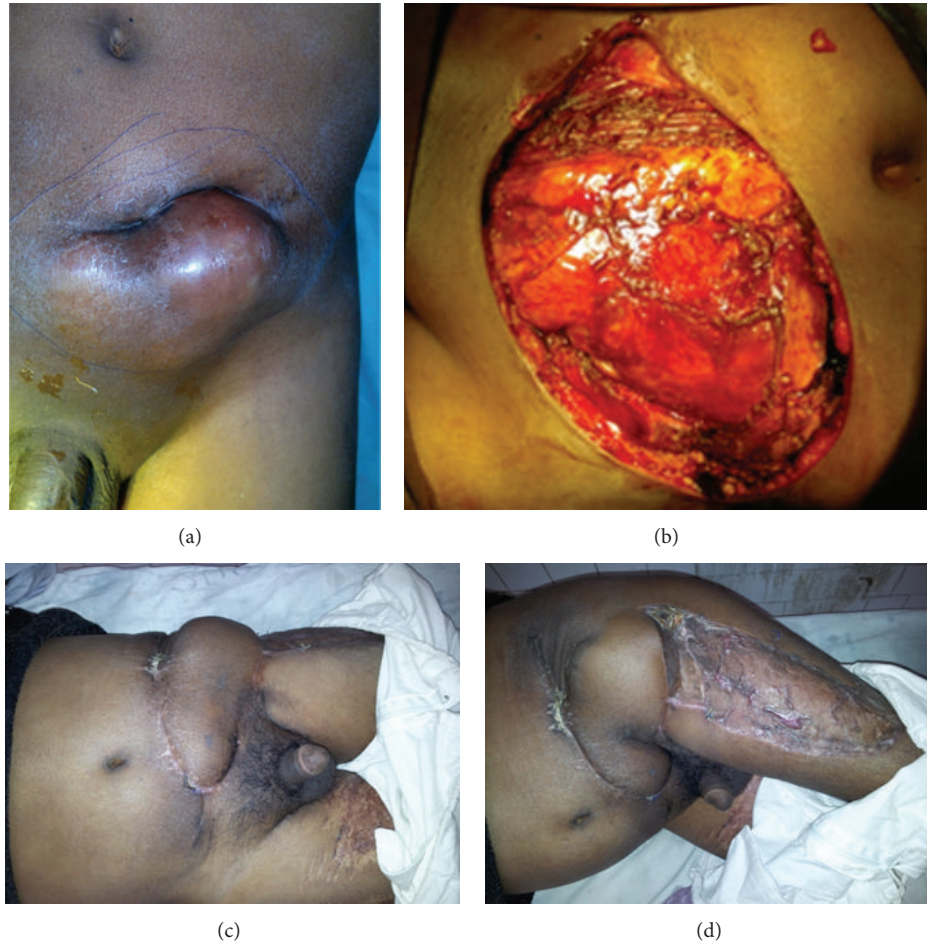
FIGURE 1: (a) Left lower abdominal wall malignancy (dermatofibrosarcoma). (b) Defect after local wide excision of tumour. (c) Follow-up photograph showing well set flap. (d) Follow-up photograph showing well set flap and well taken-up skin graft.

fascia lata is an effective flap that avoids the use of mesh and having a low incidence of recurrent herniation [27, 28].