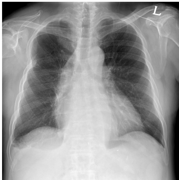
Fig. 1. Preoperative chest X-ray showing right pleural thickening with no active lung lesion.

Video 1. The video shows the yellowish-green gastric fluid refluxed and aspirated during endotracheal intubation. ( https://jdapm.org/src/sm/jdapm-18-111-s001.MP4 )