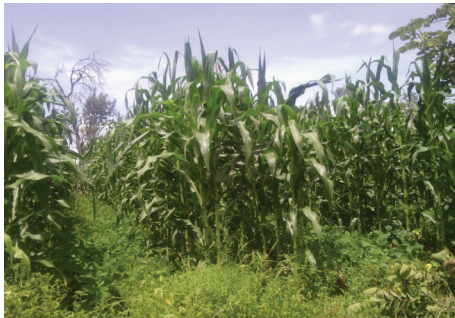
FIGURE 2: A smallholder farming system in Mbeere North, Kenya, showing a maize-common bean intercrop, under reduced tillage cultivation, which also incorporates agroforestry. Legume-rhizobia symbiosis fixes nitrogen which enhances growth of both the legume and the cereal crop. Arbuscular mycorrhizal symbiosis is enhanced which promotes nutritional uptake by both crops and also increases N_2 fixation by availing P. Agroforestry trees most of which are legumes that provide host to the beneficial soil microorganisms especially after farmers harvest the other crops.

distributed nutrients needed for their growth. Hence, they enable the flow of energy-rich compounds necessary for nutrient mobilization while at the same time providing a way through which the mobilized products are transported back to their hosts. It is therefore essential to understand the ecology and functioning of arbuscular mycorrhizal symbiosis with the aim of improving their functionality in SHS.