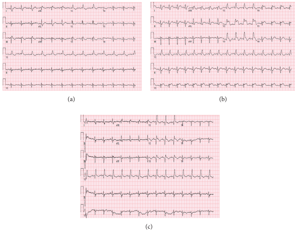
FIGURE 1: (a) Baseline EKG with RBBB. (b) EKG showing ST elevation in leads V2–V5. (c) EKG showing resolution of the ST elevation following LAD intervention.