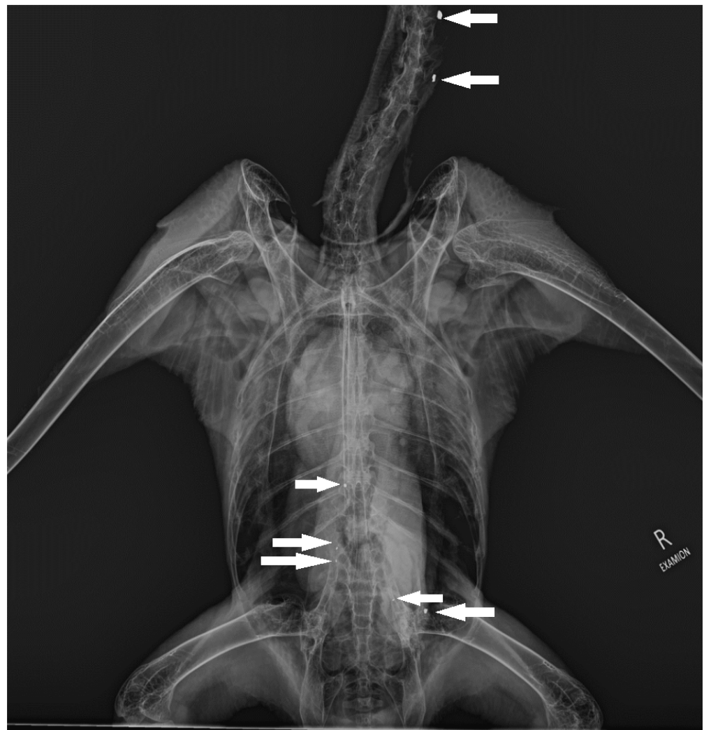
Figure 2. The ventrodorsal radiograph of adult White-Tailed Sea Eagle ( Haliaeetus albicilla ) (number 5). Arrow showing small metallic opacities suggestive for ingested Pb ammunition particles in different segments of gastrointestinal tract.