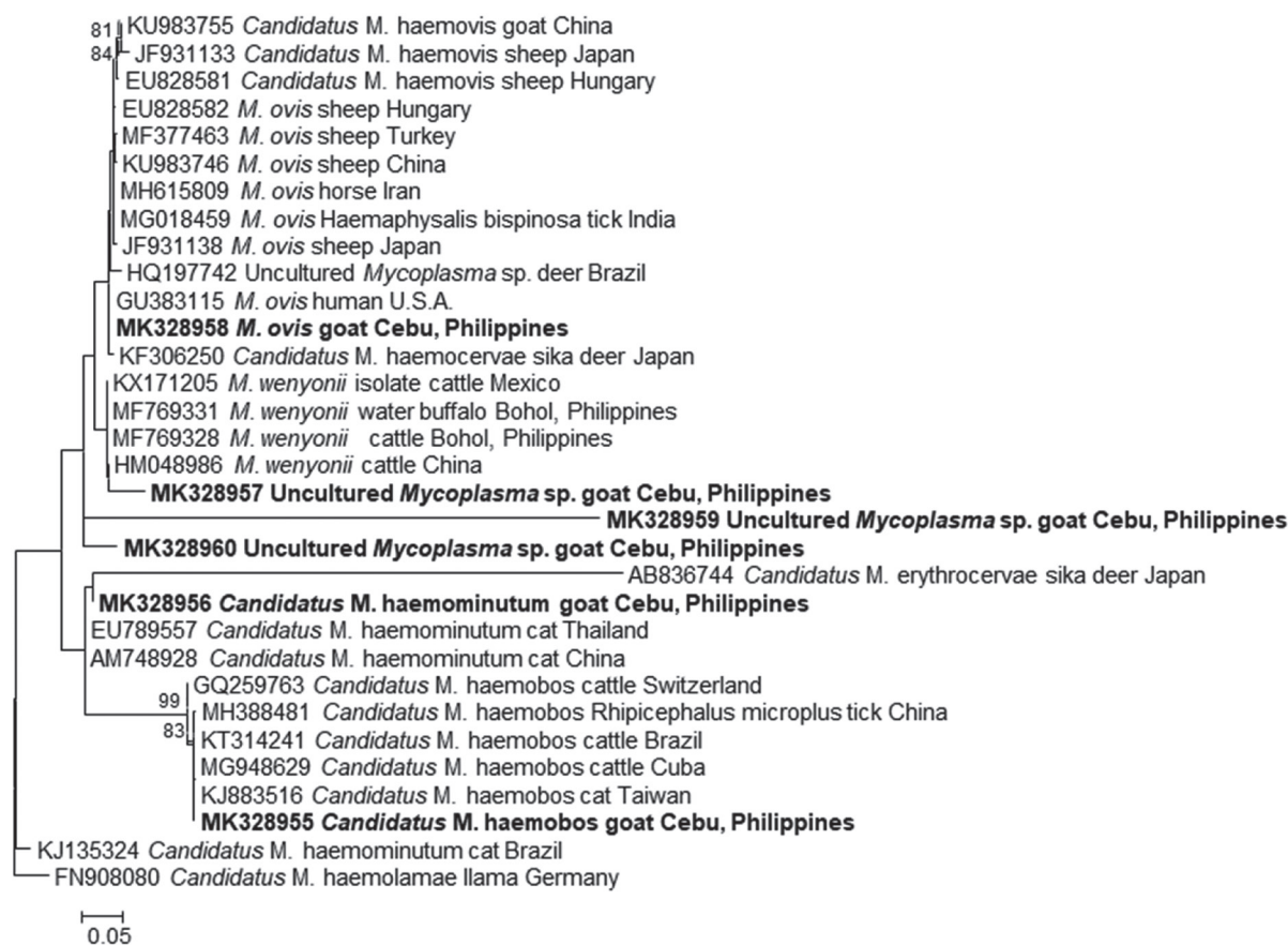
Fig. 2. Phylogenetic analysis based on 16S rRNA gene. The tree was constructed using maximum likelihood method with Kimura-2 parameter model and bootstrap-replicated 1,000 times in MEGA 7.0. Sequences generated from this study are displayed in bold font. Candidatus Mycoplasma haemolamae was used as outgroup.

predisposes the adult goats to become more infected with hemoplasma compared to young ones [10]. In addition, Hornok et al. [6] asserted that older goats tend to be more infected as once-infected goats become long-term carriers of hemoplasma. All hemoplasma-infected goats in the current study did not show any clinical signs, further supporting the idea that these goats had persistent hemoplasma infection.