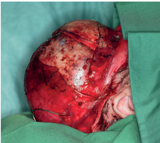
Fig. 1. Intraoperative photograph of the technique used, including frontal remodeling with advancement, and spring distraction over the lambdoid sutures bilaterally.

A consecutive series of patients were operated on with the standardized spring-assisted cranioplasty for BCS (Fig. 1) between 2005 and 2009 at the Craniofacial Unit, Department of Plastic Surgery, Sahlgrenska University Hospital, Gothenburg, Sweden, were extracted from the Sahlgrenska craniofacial registry. Computed tomography (CT) scans (Fig. 2) were routinely performed in 0.6-mm slices before surgery, at the time of spring removal, that is, 6 months after operation, and finally at 3 years of age. CT scans were obtained in the equipment General Electric Advantage Workstation Volumes share 4.3 (GE Healthcare, Buc, France).