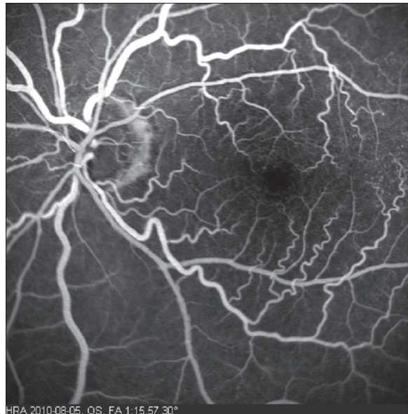
Figure 2. Fluorescein angiography of the left fundus: macular capillary telangiectasias with microaneurysms from the patient identified considerable stenosis of the left internal carotid artery.

Posterior segment signs are more frequent than anterior segment signs. On ophthalmoscopy, the retinal arteries are narrowed and the retinal veins are dilated. In some cases, both arteries and veins may be narrowed. Occasionally, spontaneous retinal arterial pulsations are observed. Retinal hemorrhages are very characteristic and are seen in about 80%