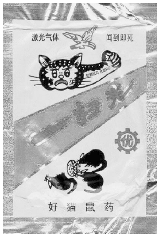
Fig. 2 Package of tetramine-based rodenticide brought to New York by vacationers returning from a visit to China in 2002. After coming into contact with the powder, a 15-month-old child was permanently injured from tetramine intoxication. The name of this brand, Yisaoguang (roughly translated as “one fell swoop”), is a fairly common name for this rodenticide in the PRC. It is also illegal.

Public health authorities, particularly those serving communities with large overseas Chinese populations should be on the lookout for this dangerous and unregulated rodenticide. Due to the high persistence of tetramine in the environment, it is especially critical that this highly toxic and stable compound be monitored for its presence in the food chain. Although aggressive surveillance is underway in the PRC to find and remove tetramine rat poison from informal markets, it is unknown how effective regulatory enforcement in China has been in removing this hazard. Reports from China have thus far indicated uneven progress in enforcing the prohibition of tetramine and other illicit chemical compounds for sale in open markets (Beijing Daily News 2002).