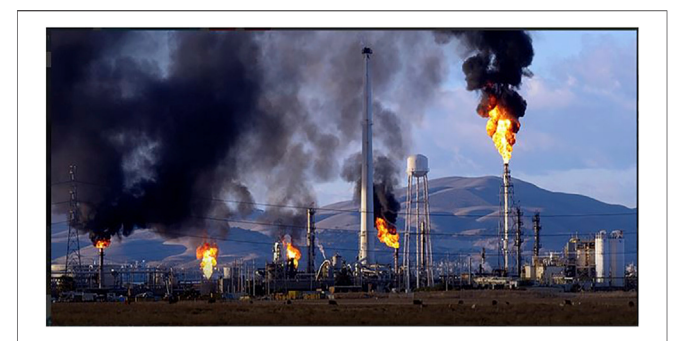
FIGURE 1 Typical pollution of the environment from a refinery (https:// africanclimatereporter.com/2019/06/05/environment-day-climatologisttasked-industry-company-refinery-owners-in african-on-mandatory-treesplanting-and-reduce-polluting-the-atmosphere/).

Some of the common environmental pollutants include toxic metals such as lead (Pb), cadmium (Cd), mercury(Hg) and arsenic (As), as well as polycyclic aromatic hydrocarbons (PAHs), polychlorinated biphenyls (PCBs), pesticides and diesel exhaust particles among others (Anetor et al., 2008; Mojiri et al., 2019). Some of the common exposure sources of these pollutants and their health effects are listed in Table 1 .