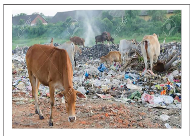
FIGURE 3 | Animals in a Polluted environment grazing on polluted soil(https://www.123rf.com/photo_29,849,393_cattle-and-land-pollution. html).