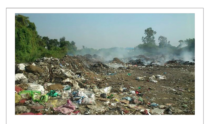
FIGURE 2 | The Effect of Soil Pollution on the living (Baruah, 2020).

Contaminants in the soil can also directly enter the human system through contact with the skin or inhalation of polluted soil or dust. In the same vain, water pollution has a negative impact on the viability and sustainability of water resources, as well as the proper growth and development of fish and other aquatic organisms, which are considered as important food sources ( Figure 4 ). These all lead to a state of vicious cycle. Animals consume the contaminated fish and plants as well as drink the contaminated water leading to serious threat to their health and sustainability as well as disruption in the predator–prey interactions. The pollutants continue to travel up the food chain until they get to humans who eat the food and experience