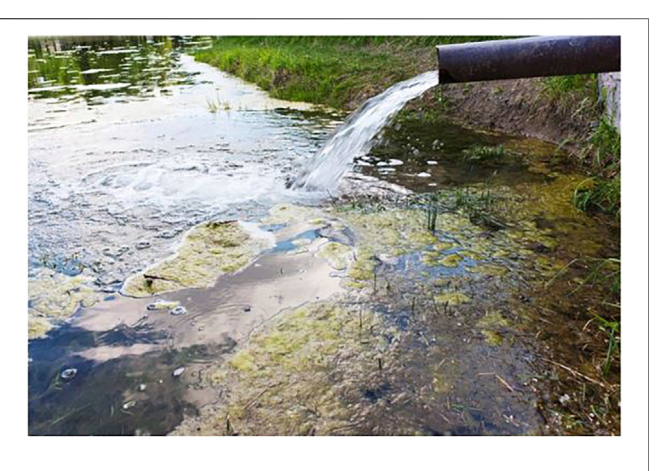
FIGURE 4 | Water pollution (https://www.openaccessgovernment.org/ water-company-fined-for-unpermitted-Pollution/48105/).

deleterious effects on their health as well their behavior and productivity (Chang et al., 2019; Warra and Prasad, 2020). This was classically manifested in the well-known Minamata disease; an environmental epidemic in Minamata Bay, Japan, caused by methyl-mercury poisoning by residents who ate a considerable amount of fish contaminated with wastewater discharged from a chemical company (Murata and Karita, 2022).