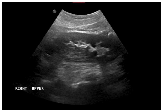
Figure 2 Sagittal abdominal ultrasound of right kidney at 1-year post-op demonstrating complete resolution of hydronephrosis.

fashion. 1 Dynamic imaging (supine and upright), which correlates symptoms to functional obstruction, remains the cornerstone in the diagnosis of nephroptosis. Our literature review revealed the common use of upright and supine ultrasonography, diuretic renography and intravenous urography in diagnosis; although its use has been posited, the Whitaker test has not been documented in the diagnosis of nephroptosis. 4 Supine and upright intravenous urograms have historically been the standard diagnostic tool; however, diuretic renography and dynamic ultrasonography are complementary modalities that have been playing an increasing role in diagnosis. Diuretic renography is favoured as it can document renal obstruction via radiotracer excretion, decreased renal perfusion and/or changes in renal function. 5 Nevertheless, diuretic renography has been found to be less sensitive than supine and upright ultrasound for diagnosing nephroptosis. 6 Dynamic colour Doppler with estimation of renal artery resistive index (peak systolic velocity–end diastolic velocity/peak