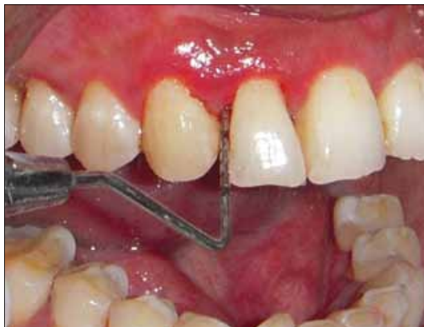
Figure 1: Probing depth

scaling and root planing with ultrasonic scaler and Gracey's curettes. Scaling and root planing was followed by polishing using a low abrasive paste and oral hygiene instructions were given which was followed by local application of tetracycline fibers at the involved site [Figure 3]. This was followed by