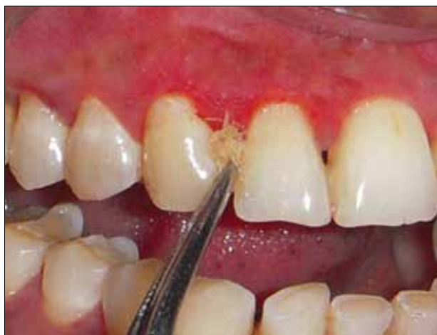
Figure 3: Fiber placement