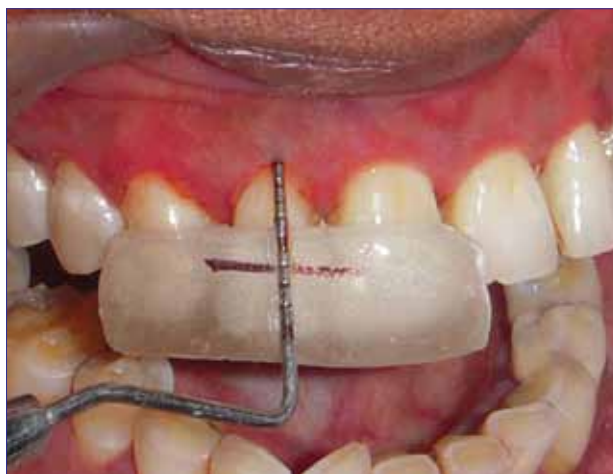
Figure 2: Relative attachment level