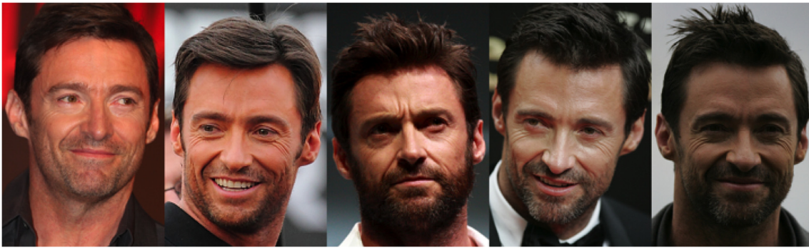
Fig. 2 Multiple photos of the same actor. There are very large differences between these images, but viewers familiar with the actor have no problem recognizing him in each of them. Image attributions from left to right: Eva Rinaldi (Own work) [CC BY-SA 2.0], Grant Brummett

(Own work) [CC BY-SA 3.0], Gage Skidmore (Own work) [CC BY-SA 3.0], Eva Rinaldi (Own work) [CC BY-SA 2.0], Eva Rinaldi (Own work) [CC BY-SA 2.0]