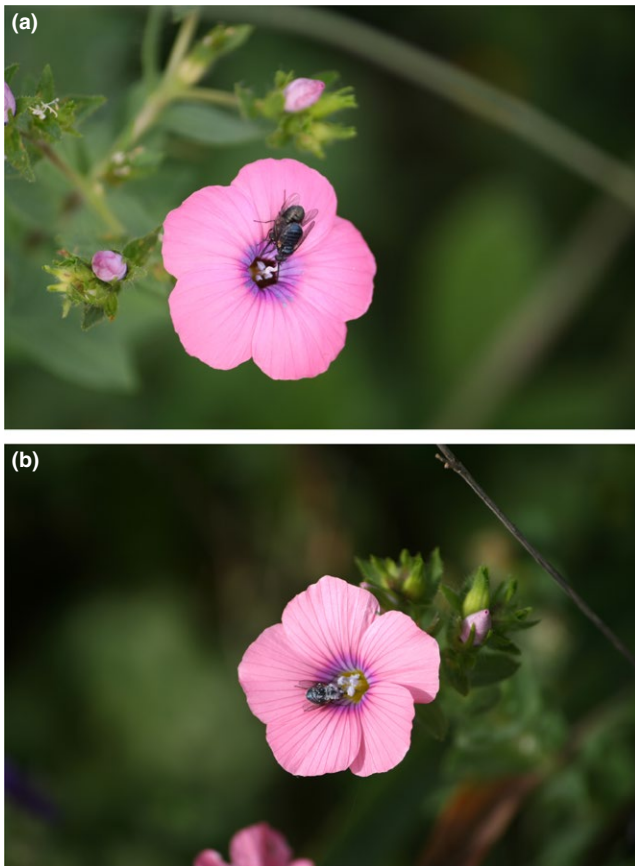
FIGURE 1 Flowers of Linum pubescens with the major pollinator, Usia bicolor bee-fly. (a) Flower with dark tube with two flies mating; (b) Flower with light-colored tube with a feeding fly

flies will prefer dark-centered flowers when searching for mating and light-centered flowers (or none) when searching for food. This predicts a mixed selection regime on floral color in L. pubescens .