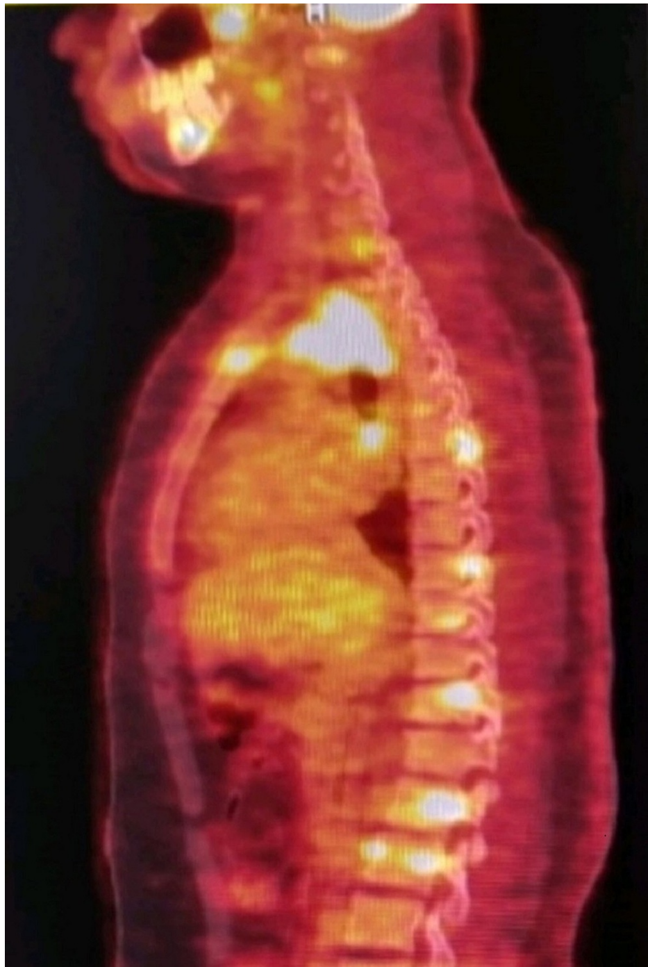
FIGURE 2: PET CT before treatment.

Image showing increased FDG uptake at multiple bony sites.