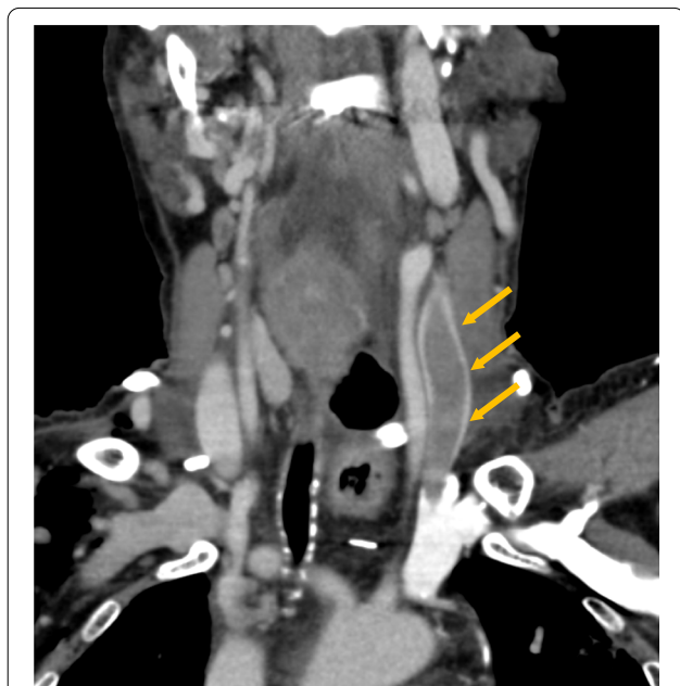
Fig. 1 Upper extremity deep vein thrombosis in the left internal jugular vein after esophagectomy with retrosternal reconstruction. Contrast-enhanced CT on the fourth postoperative day and the open arrows indicate an intraluminal filling defect in the left internal jugular vein

last step were considered as independent risk factors. P value < 0.05 was considered statistically significant. The optimal cutoff point of the width of the retrosternal space for the prediction of UEDVT was determined so that the Youden index (sensitivity + specificity – 1) would be maximized using receiver operating characteristic (ROC) curve analysis.