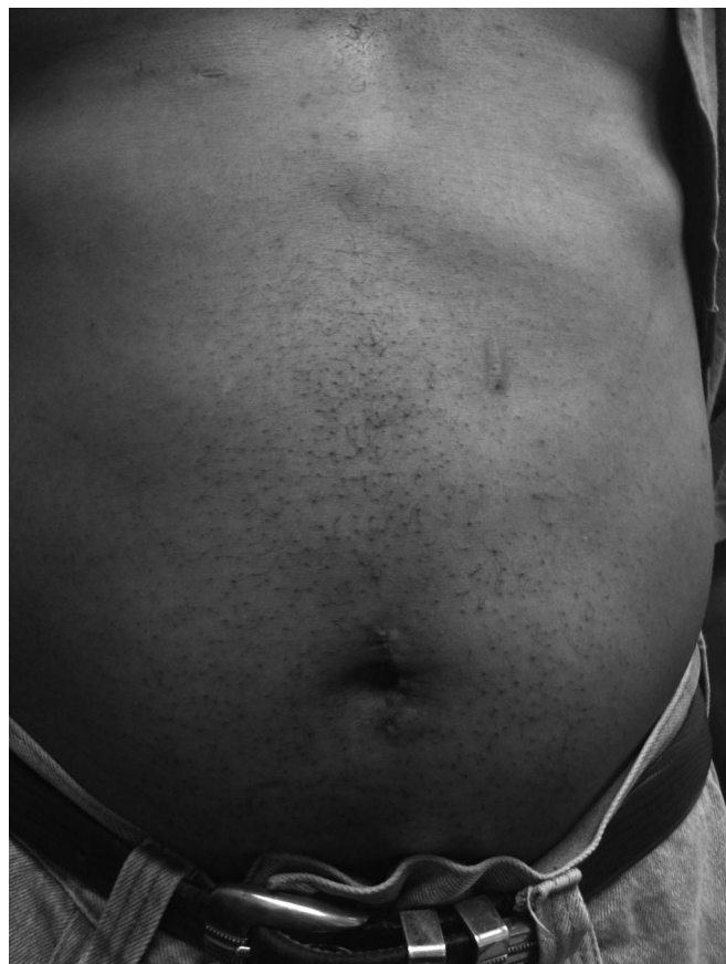
Figure 3. Cosmetic appearance of 5-cm periumbilical incision 6 weeks after surgery.

Bilateral nonfamilial synchronous renal masses comprise up to 3% of patients presenting with enhancing renal masses. 1,2 A recent analysis of the Surveillance Epidemiology and End Results (SEER) Registries Database found that 99% of patients presenting with bilateral enhancing