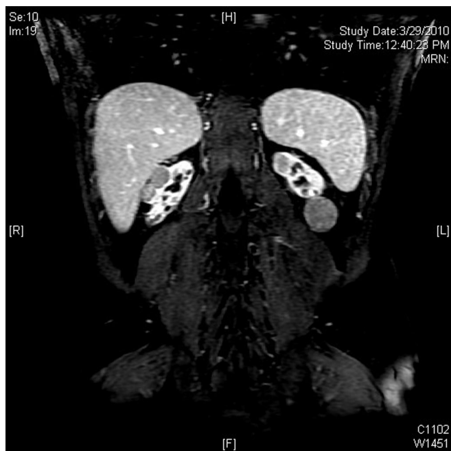
Figure 1. Coronal image from MRI of the abdomen/pelvis demonstrating atrophic native kidneys with enhancing solid tumors in both kidneys (here, 2 on the right mid-upper pole and 1 on the left upper pole), the largest measuring 3cm x 2.8cm x 3.2cm.