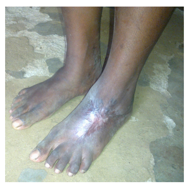
Figure 2 Soft tissue contracture of the left foot following snakebite.