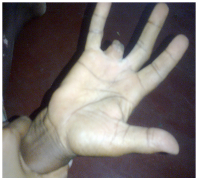
Figure 3 Amputation of ring finger of the right hand due to snakebite.

exposure to sunlight. In one, loss of vision was apparent. Russell's viper, cobra, and krait were the offending snakes in 42.9%. The complication was disabling with difficulty in reading and recognition of persons.