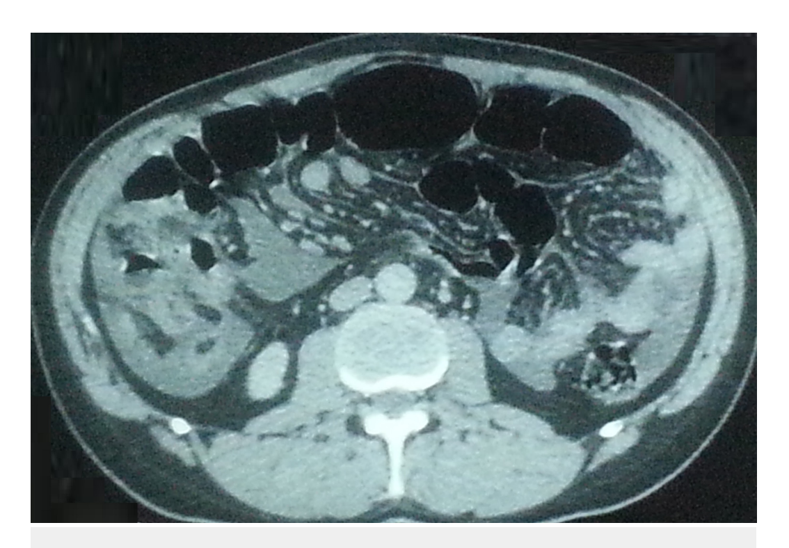
FIGURE 3: Complete regression of both the ascites and the peritoneal micronodules in computed tomography of the abdomen.