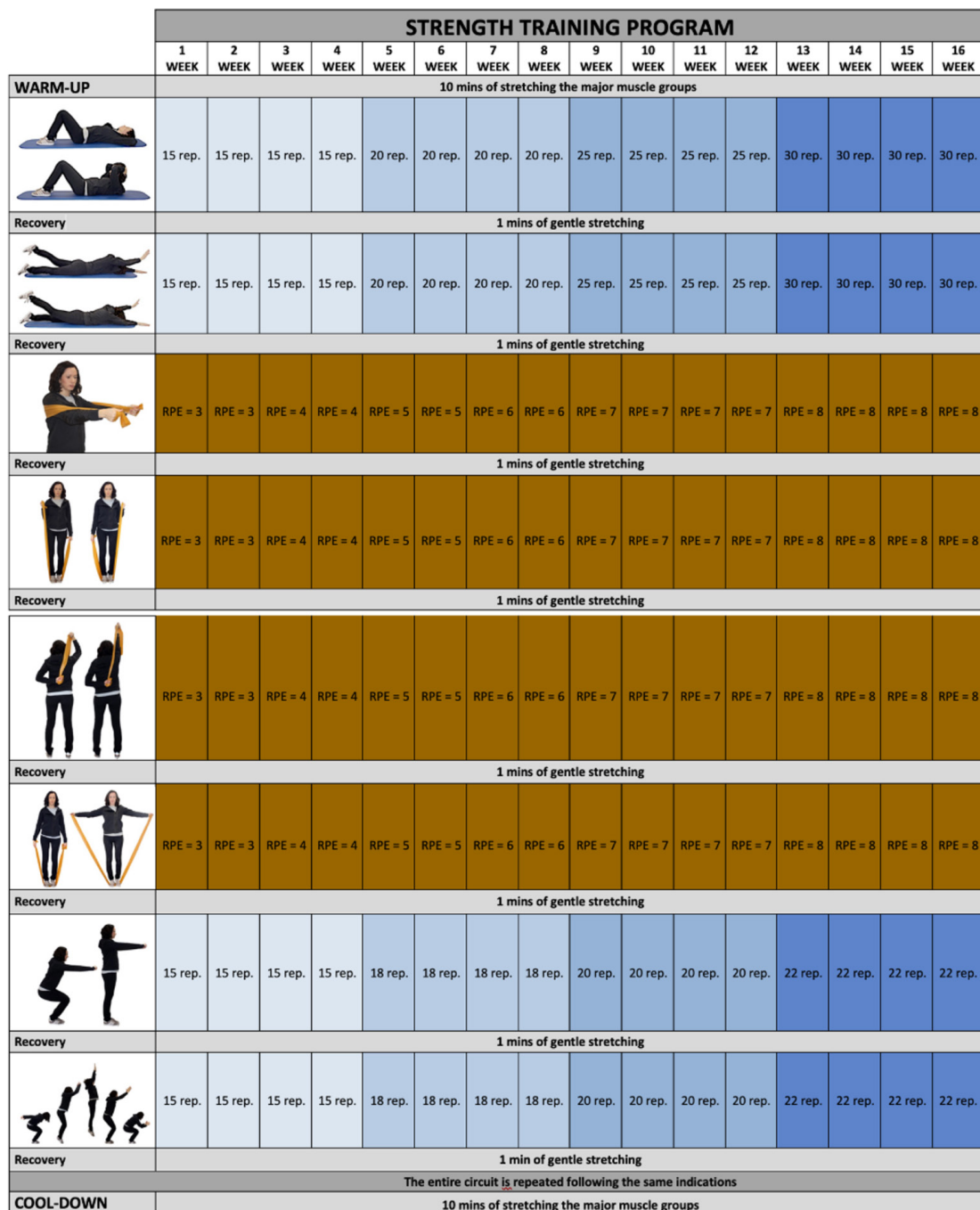
Figure 2 Strength training. Borg Rating of Perceived Exertion (RPE). rep, repetition.

and will be scheduled between 10:00 and 12:00 hours to minimise variability.