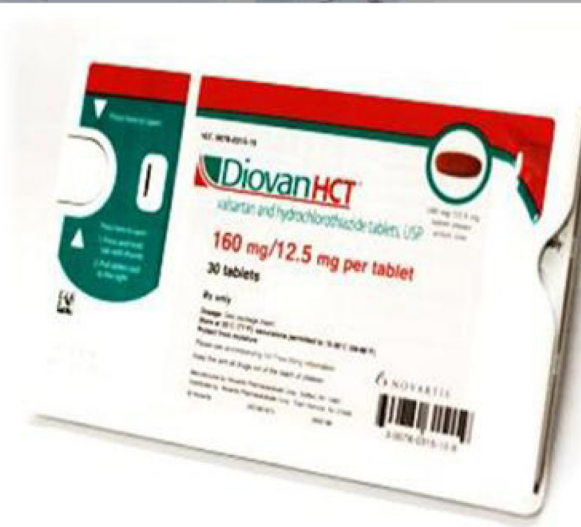
Figure 2 Reminder packaging dispensed to patients.

was provided on the cover for easy recognition. Instructions on how to open the RP were printed on the outside container cover. A reminder to reorder was found inside the blister card insert to prompt the reordering of refills by patients at the end of each monthly regimen.