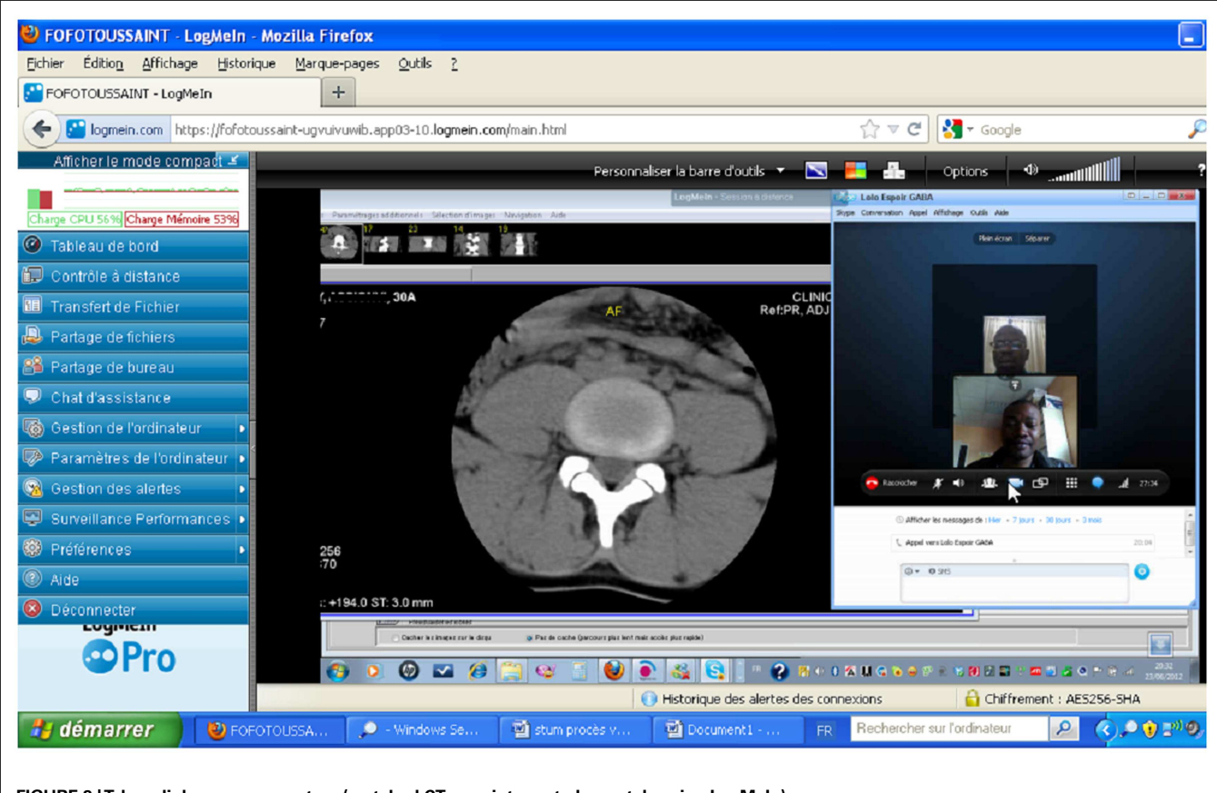
FIGURE 3 | Tele-radiology screen capture (vertebral CT scan interpreted remotely using LogMeIn).

The file transfer capability available with the LogMeIn Proversion, which allowed transfer of ultrasound files up to 100 Mb in around 3 min, demonstrates clearly that this software can be used for delayed tele-ultrasound diagnosis with ECHO-CNES in the presence of a non-expert at the patient center.