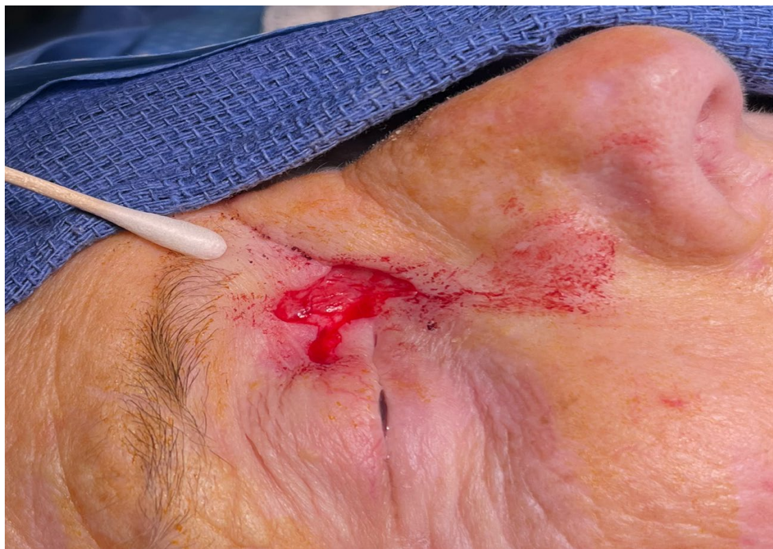
Figure 2: Intraoperative removal of scar tissue.

Regional flaps may be further broken down into different categories: Rhomboid flap 9 , Bilobed Rotational flap 10 , Paramedian Forehead Flap 11 , and V to Y flap 12 . Like the name suggests, a rhomboid flap uses a rhomboid shape for the transposition process. A bilobed rotational flap utilizes a similar technique in which a bilobed area of skin is transposed in a clockwise/counterclockwise manner, replacing the transected skin. A paramedian forehead flap utilizes a portion of the forehead skin to replace affected tissue. After healing, there is often some excess skin and adipose tissue in the repaired area; therefore, the healed area is often again surgically corrected to provide better cosmetic outcomes. A V to Y flap involves created a "V" shaped flap that is pulled away from the excision to cover another area; final suturing results in a "Y" shaped area, hence the