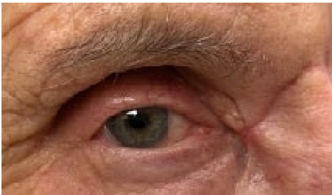
Figure 3: 3-month postoperative follow-up. Patient is able to sustain eye opening

name. While these are effective techniques in their own regards and have been used previously, they seemed less applicable given the patient described in the case. If a flap technique is used for medial canthus repair, it is recommended that it comes from an area of skin that matches in terms of texture, thickness, and color. Skin from the eyelids is often an excellent match for use in revision; however, this may confer the risk of contracture or subsequent limitations in mobility for the patient 13 . Median forehead flaps confer the risk of changing the medial brow position 13 .